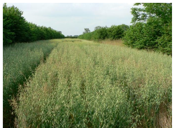
Oat variety trial at ORC Wakelyns

This requires an integrated approach combining innovative breeding and crop management techniques. Comparative trials are coordinated across a wide range of geographical locations, covering the main agro-ecosystems of Europe as well as sub-Saharan Africa and the Middle East. Dissemination of the results is of high importance and there will be a number of knowledge transfer events in different countries.