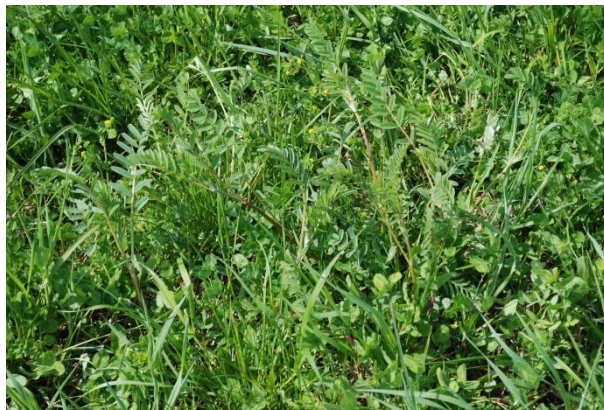
Legume All Species Mix at Yatesury

The project is led by the French National Institute for Agricultural Research (INRA) and brings together 22 partners from the private and public sectors, representing ten European and two African countries (Ethiopia, Mali), and one international research organisation (ICARDA).